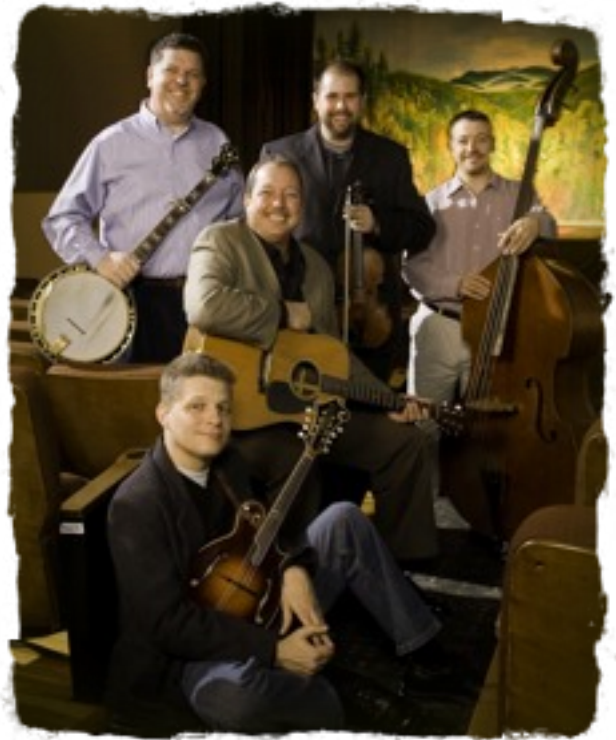
IIIrd Tyme Out

complete band of the past two decades" Opening for TTO will be one of Southern California's most accomplished and popular Bluegrass bands, Lonesome Otis . Seating is limited, so order you tickets early and don't be disappointed.