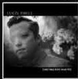
JASON ISBELL Something More Than Free jasonisbell.com