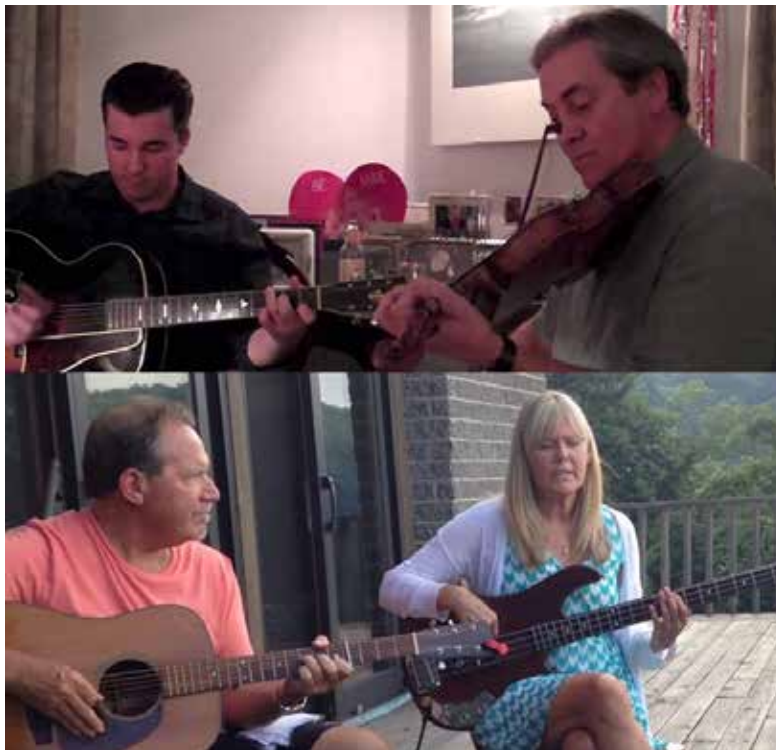
The Coyote Brothers