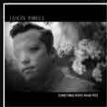
JASON ISBELL Something More Than Free jasonisbell.com