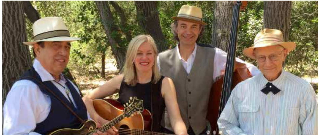
The Bluegrass Ghosts

The Bluegrass Ghosts is a Southern California band that takes the spirit and intensity of Classic Bluegrass Music as it's principal inspiration, including the mountain modalities, country blues, instrumental drive and the relaxed Southern "something" that makes Bluegrass Music so compelling.