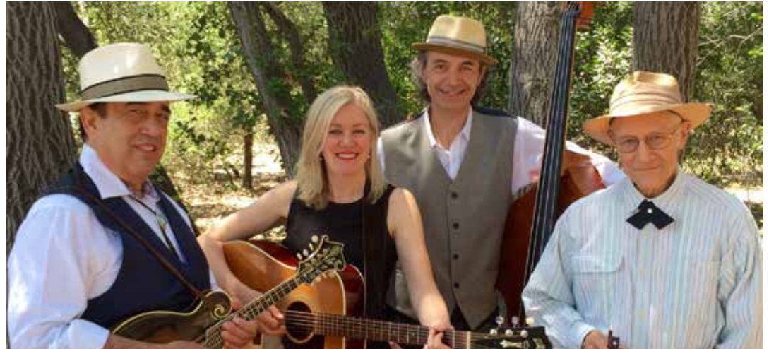
The Bluegrass Ghosts

The Bluegrass Ghosts is a Southern California band that takes the spirit and intensity of Classic Bluegrass Music as its principal inspiration, including the mountain modalities, country blues, instrumental drive and the relaxed Southern "something" that makes Bluegrass Music so compelling.