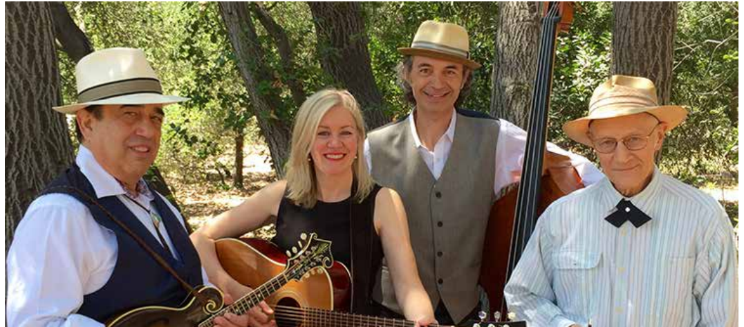
The Bluegrass Ghosts

The Bluegrass Ghosts is a Southern California band that takes the spirit and intensity of Classic Bluegrass Music as it's principal inspiration, including the mountain modalities, country blues, instrumental drive and the relaxed Southern "something" that makes Bluegrass Music so compelling.