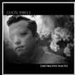
JASON ISBELL Something More Than Free jasonisbell.com