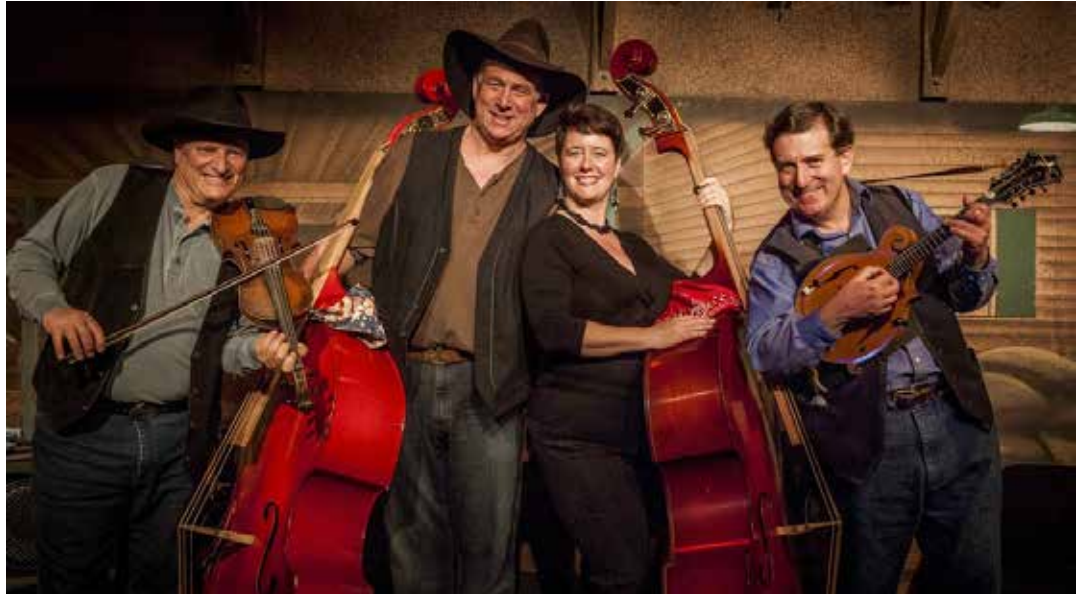
THE MISKEY MOUNTAIN BOYS

Viva Cantina Mexican Restaurant 900 Riverside Drive, Burbank CA