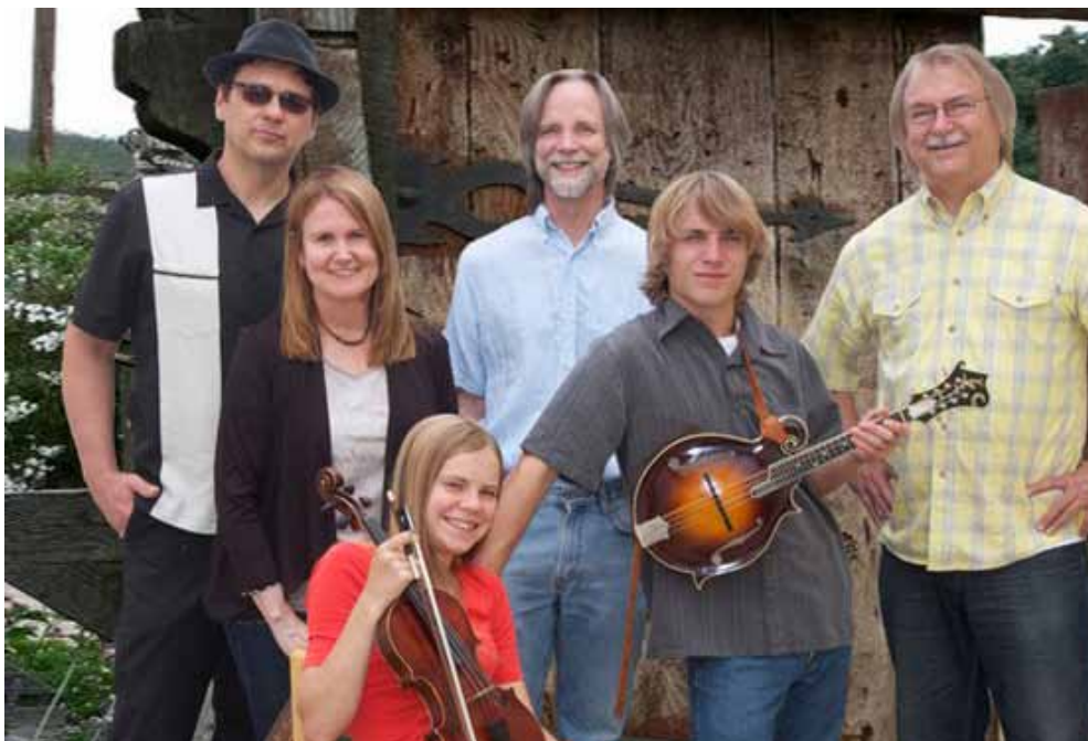
The Murphy Family Band

Viva Cantina Mexican Restaurant 900 Riverside Drive, Burbank CA